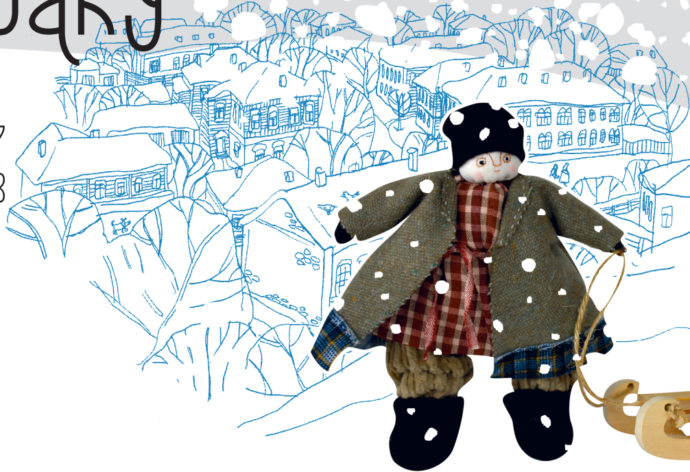
Phonepaseuth Soulinthone Laos