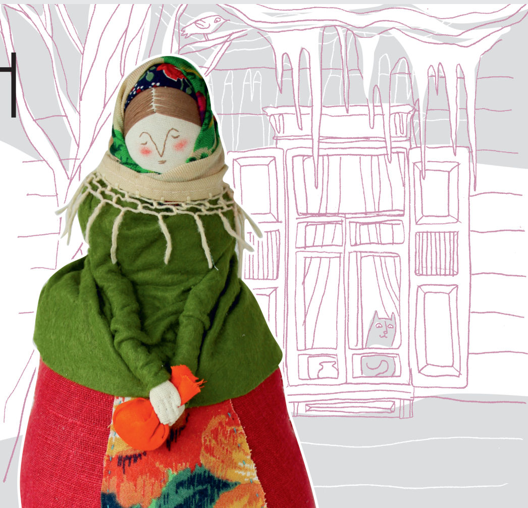
Hoang Thi Hong Trang Vietnam