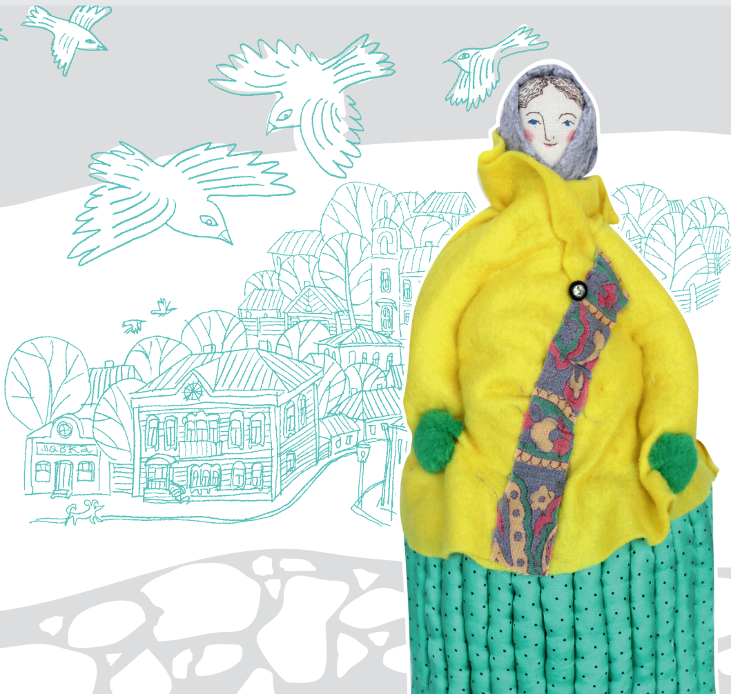
Eva Burbo Lithuania