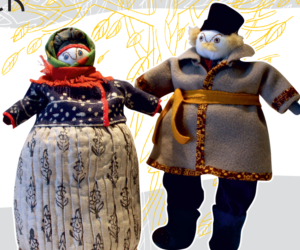
Mohamed Buizem Morocco